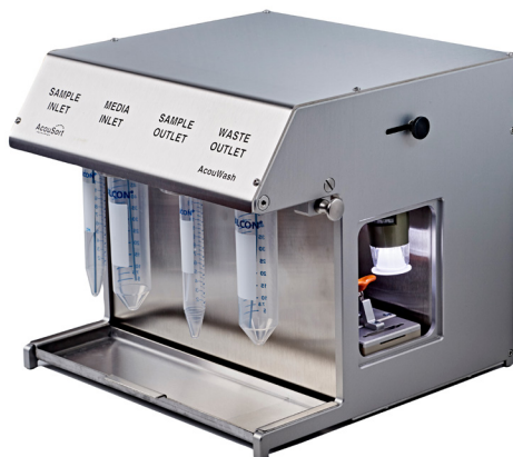
AcouWash, Automated Cell Washing

When washing cells after labelling, the AcouWash can completely remove unbound labels in one wash as the cells are individually transferred from one medium to another by mild ultrasound exposure in a flow channel. The AcouWash saves time by replacing, in a single run, the repeated centrifugation and manual resuspension that is often required in manual labelling protocols.